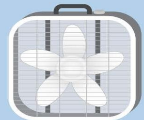
20"x20" Box Fan