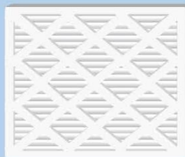
20"x20" Air Filter (MERV rating 13 or higher)