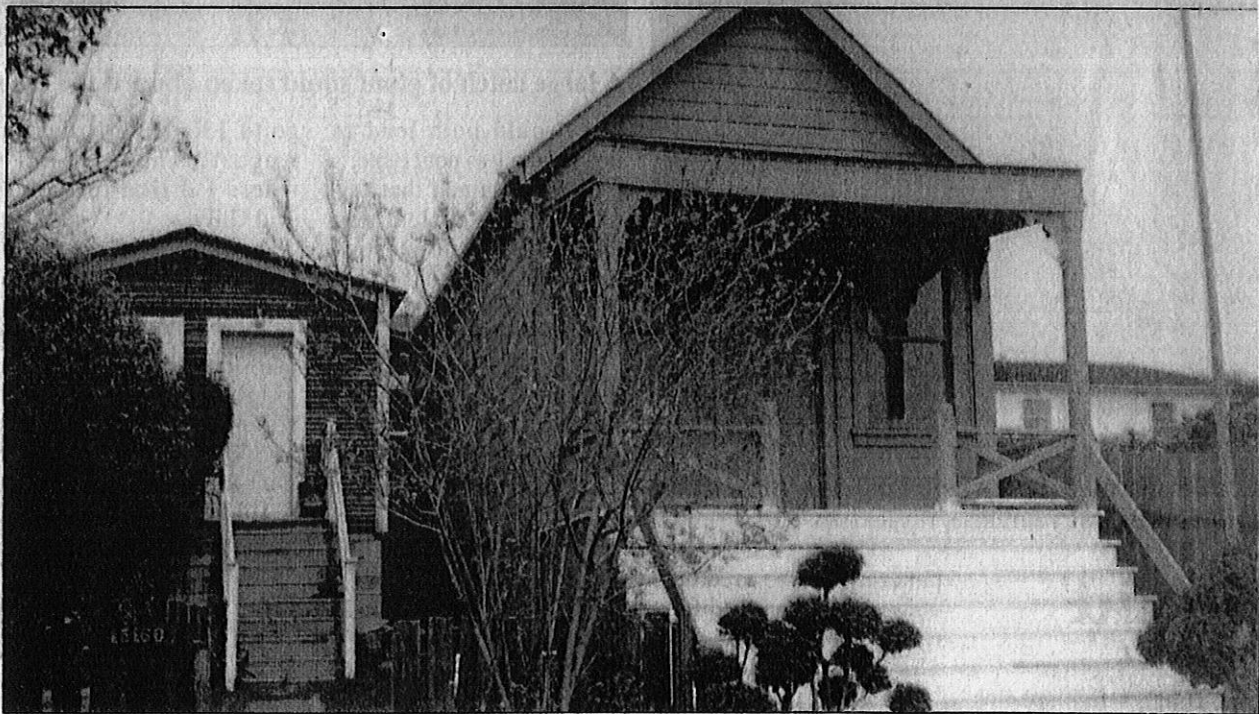
The Category I Temple of Kwan Tai (circa 1852), 45160 Albion St., was fully restored and rededicated in 2001. It is registered as California Historic Landmark #927 and has been in continuous use as a Taoist Temple.