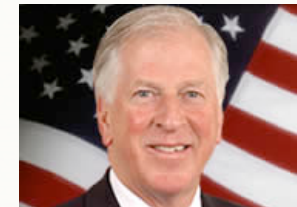
Congressman Mike Thompson