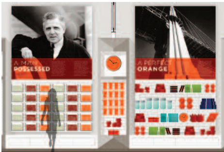
Rendering of Pavilion exhibit panels

IMPROVED BRIDGE CAFE The menu will get a makeover, with an emphasis on delicious selections that are fresh, local, and organic.