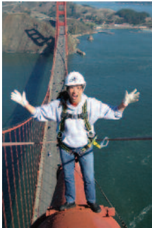
Simulated “green screen” photo

At the new Golden Gate and Pacific Overlooks above the Presidio bluffs, and from the vista point overlooking Fort Point, visitors will see the Golden Gate in a new light. Not just an engineering marvel, the Bridge is a pathway for exploring history and nature—the world’s most famous “trail!”