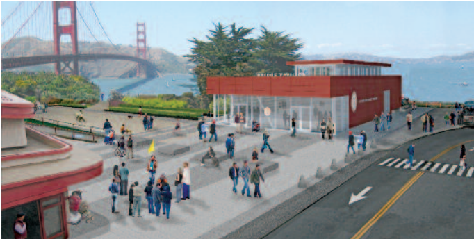
Rendering of visitor experience improvements at south plaza

BETTER CONNECTIONS TO PARKS The Bridge is flanked by the Marin Headlands to the north and the Presidio to the south—both sites in the Golden Gate National Parks. Improved trails—such as the nearby Bay Trail segment—bring Bridge visitors from the majesty of a national landmark to the wonder of a national park.