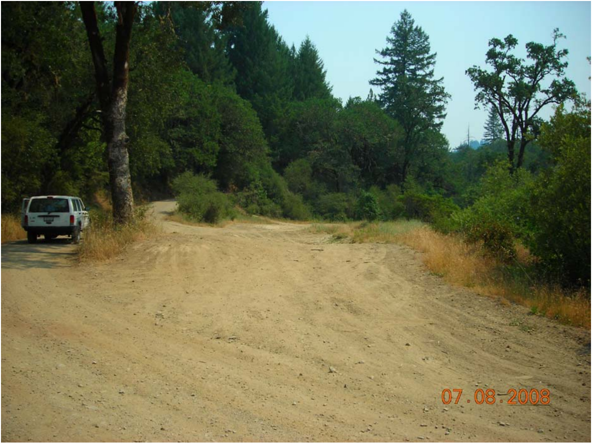
Photo 3. One of many off road vehicle areas delivering sediment to Cave Creek.