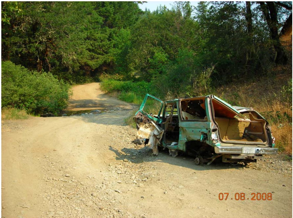
Photo 2. Another abandoned and vandalized vehicle just upstream of Crossing 2.