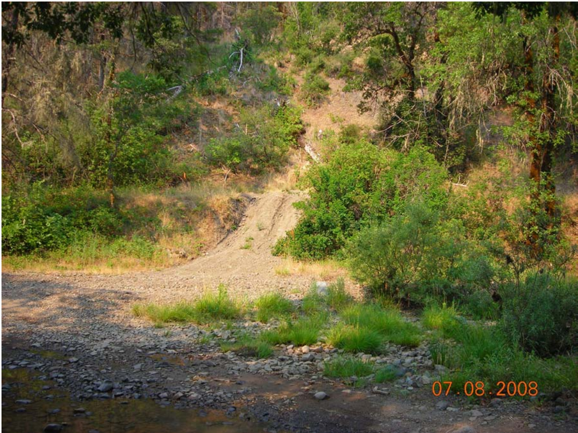
Photo 5. Many ORV trails lead directly to the creek bed.