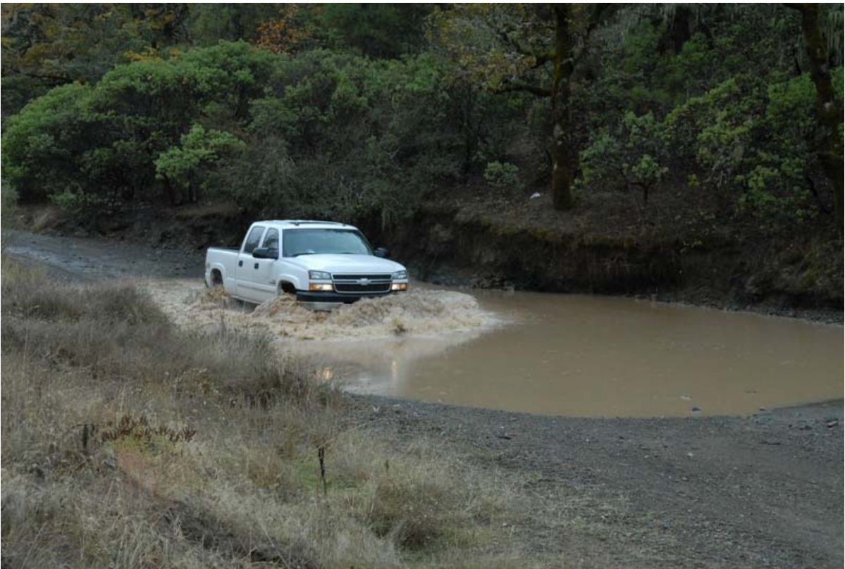
Photo 8. Hydrocarbons and other pollutants such as brake dust, oil and gasoline are easily delivered to stream waters from crossing vehicles.