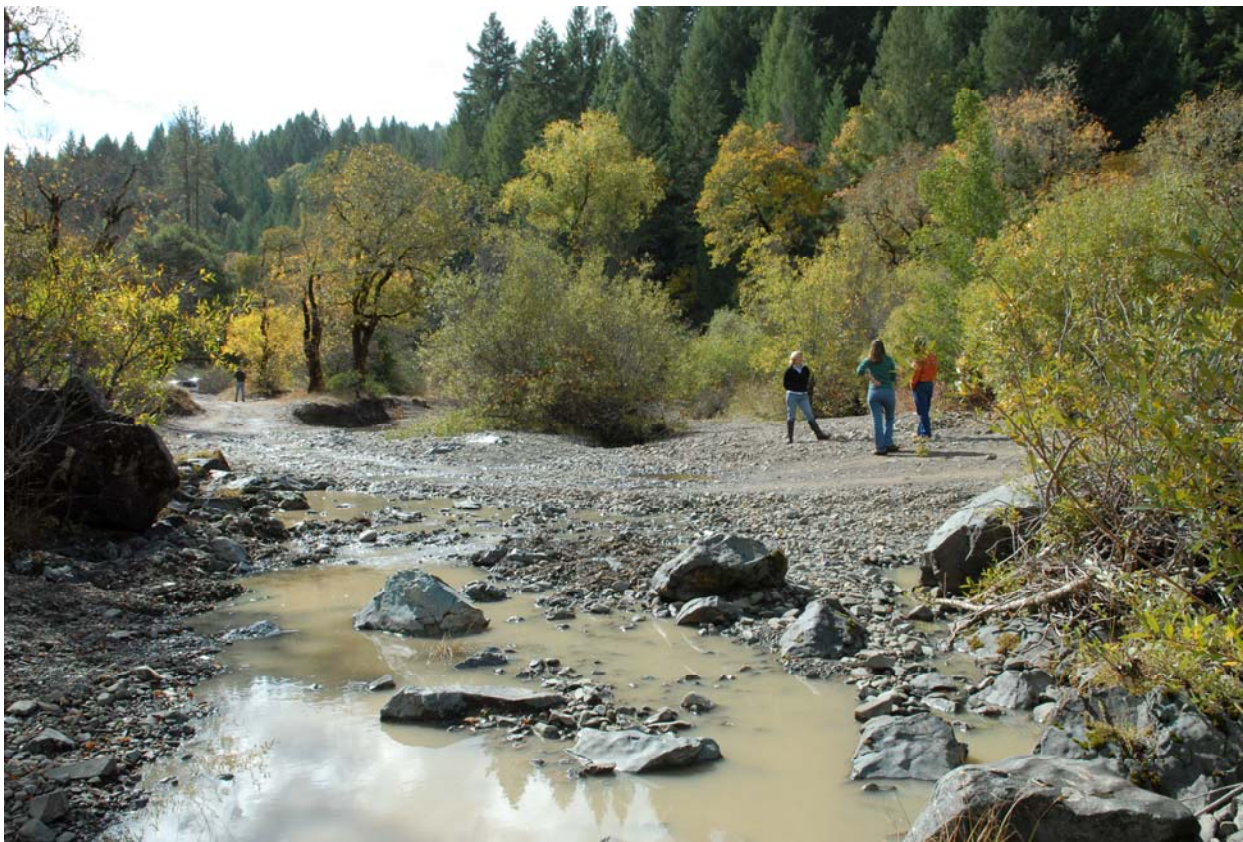
Photo 10. The widest ford, Crossing 9 is viewed from Cave Creek, looking upstream. The channel flows around the willow clump in the center; banks on both sides are actively eroding.