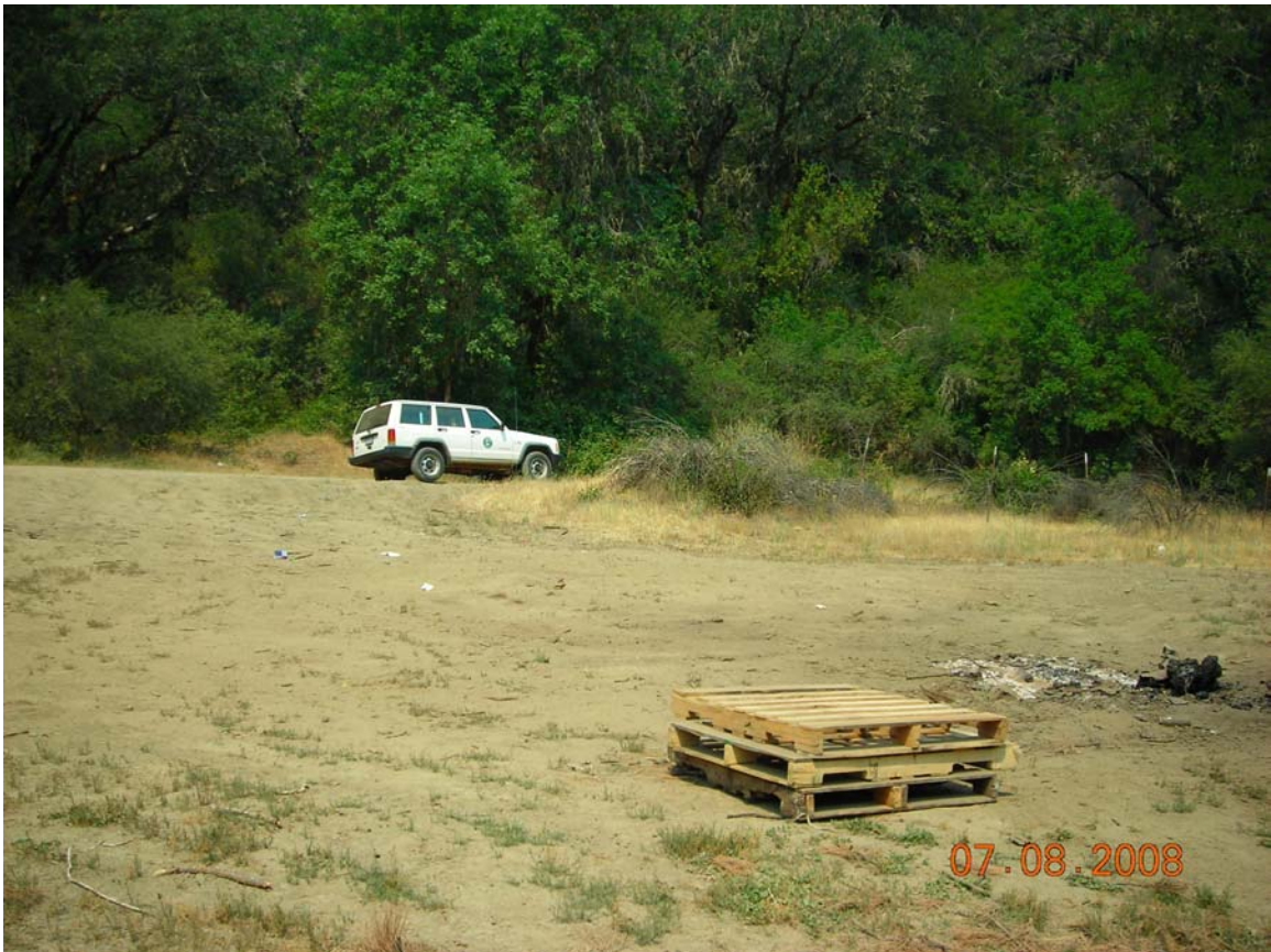
Photo 6. Popular off road area with bare, compacted soils littered with trash and remnants of a fire pit.