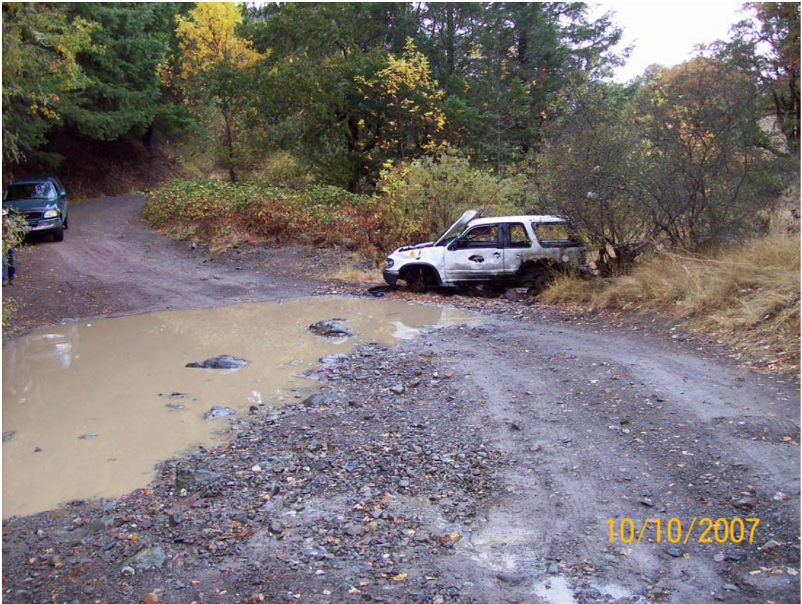
Photo 1. Abandoned car has been vandalized, burned and left in the creek at Crossing 2 where it remained for weeks. Turbid waters typical at crossings.