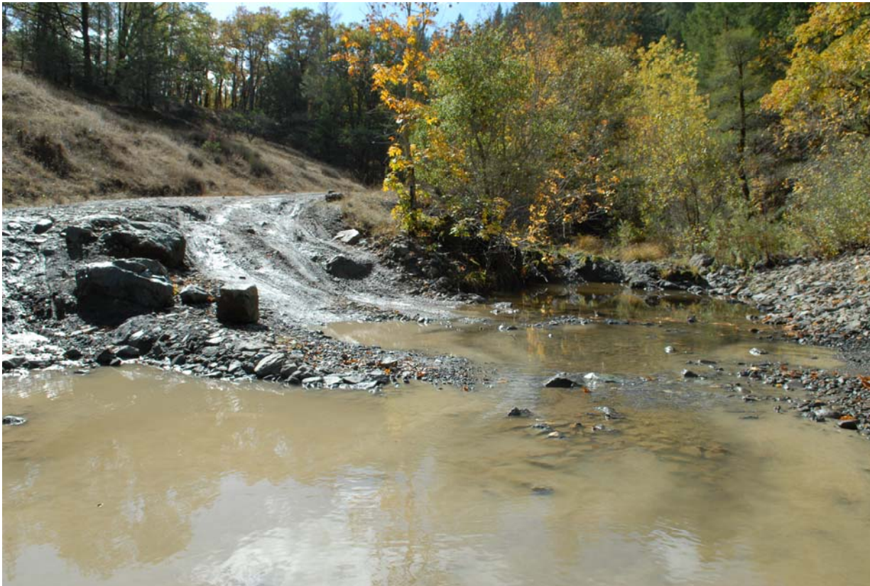
Photo 9. Steep, rocky, angled approach at Crossing 7.