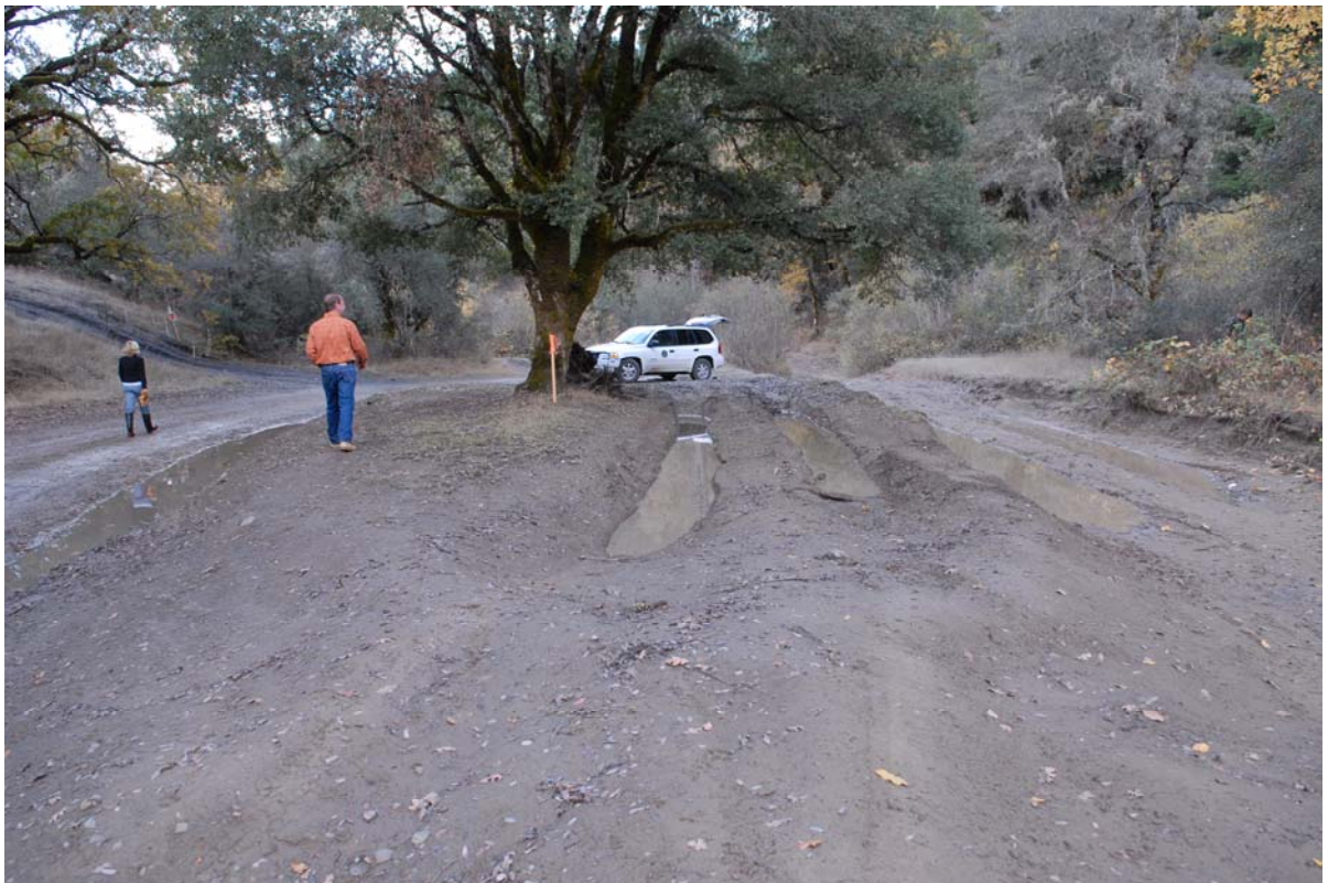
Photo 4. Severely degraded area adjacent to Cave Creek between Crossings 8 and 9. Ruts created by ORV activity.